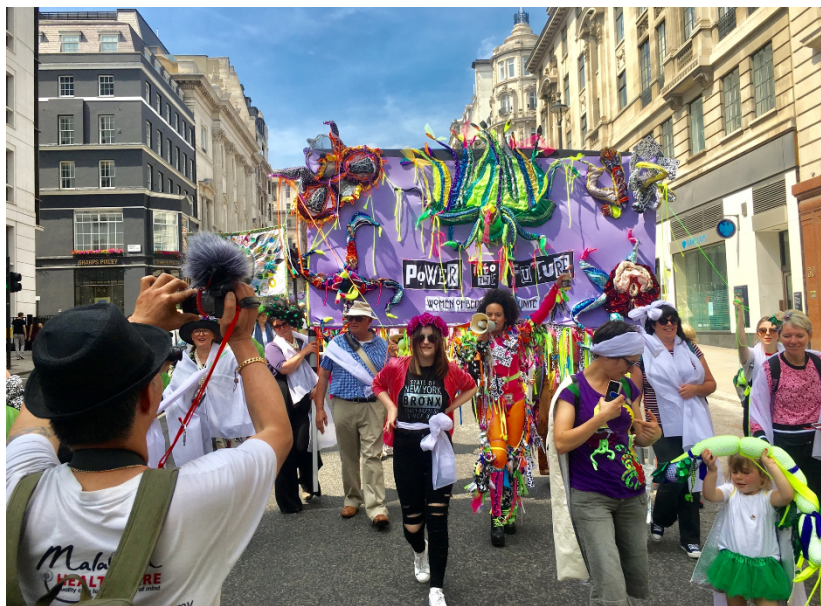
Processions, 2018

Bedford Creative Arts is an Arts Council England National Portfolio Organisation. Our Registered Charity No. is 1119555. Company Limited by Guarantee 5305188.