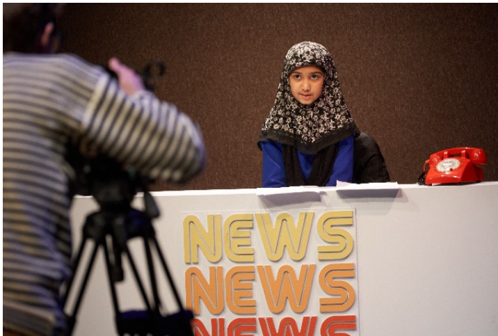
News News News

We also support our local peers through advice, mentoring & partnership to develop a thriving cultural ecology for Bedfordshire and work intensively in the education sector to inspire young people and schools to engage with culture.