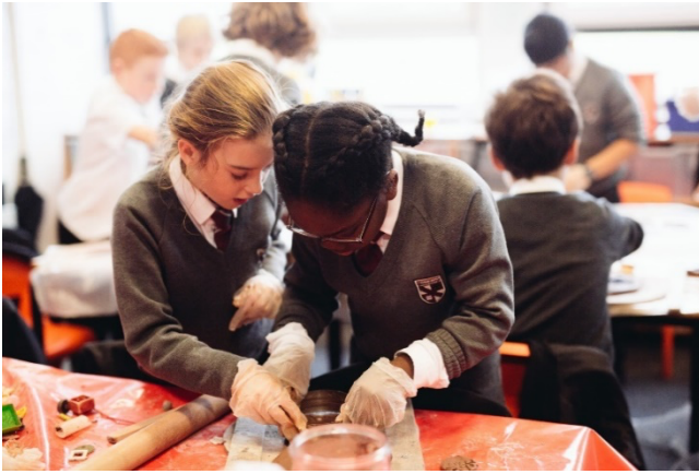
Beauchamp 'imagined futures' day

We recognise that as a publicly funded organisation with significant experience we have a duty to develop the creative ecology in Bedfordshire. This means that we take an active and leading role in supporting networks, consortiums and talent development for artists, producers, communities and organisations in Bedfordshire.