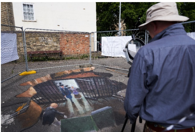
The Vault 3D mural

We run a Producer Hub for Bedford with 1 Degree East that mentors and supports local producers and self-producing artists to develop their skills. We are also co-founders of the free practitioner network, Creative Bedfordshire, regularly delivering networking and skills sharing events for our creative community.