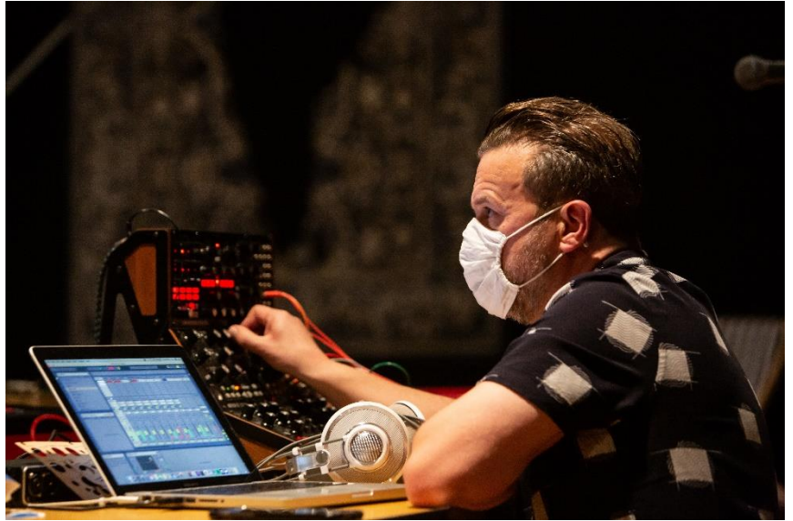
Airship Dreams: Escaping Gravity