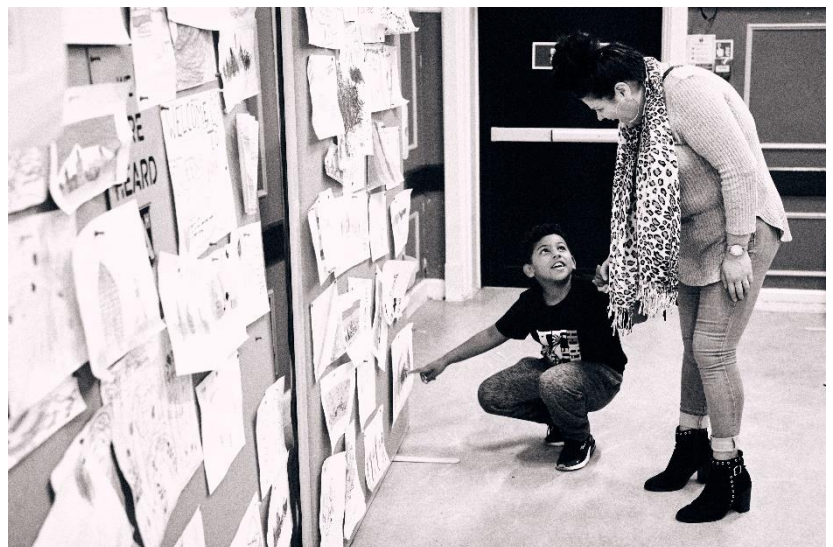
Take Part Queen's Park