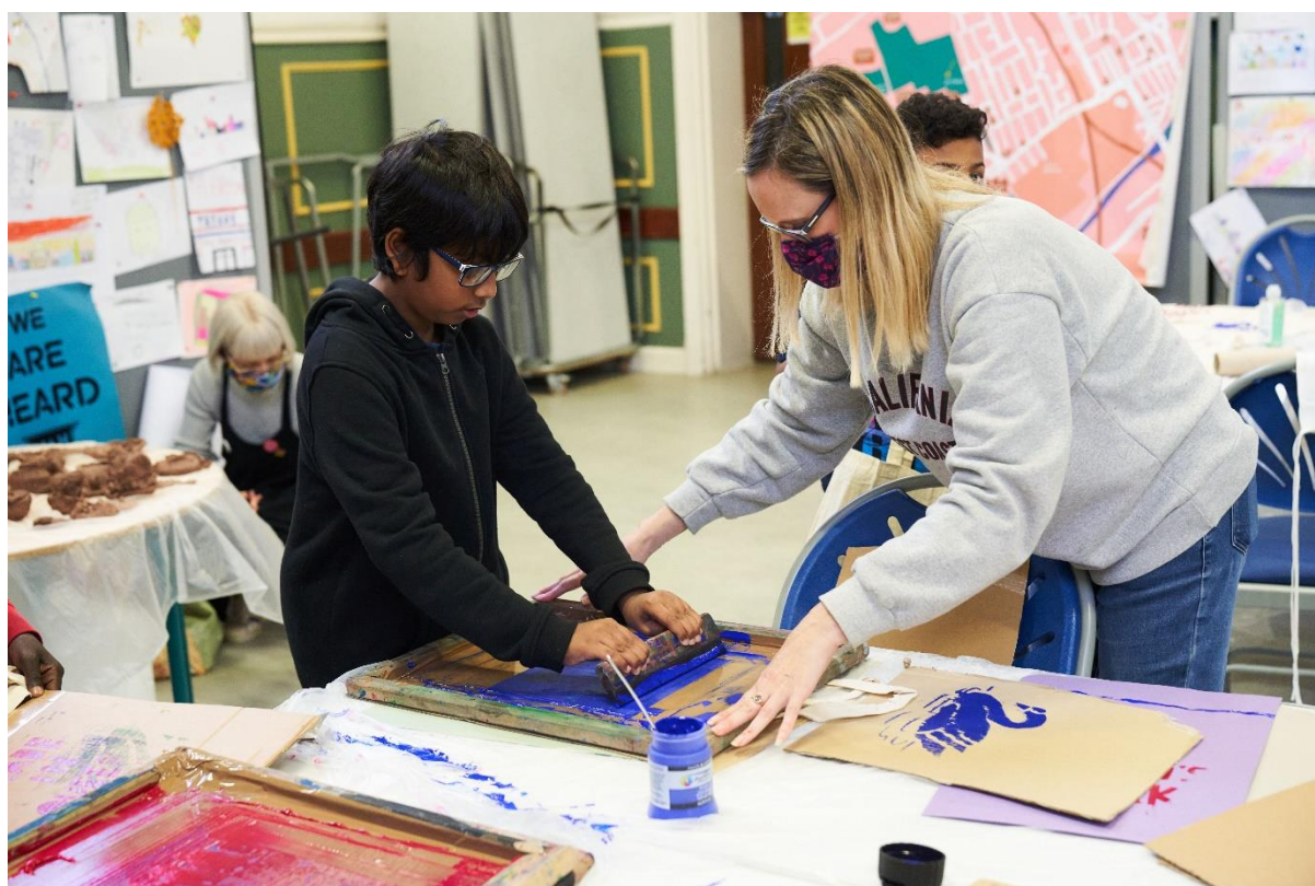
Take Part Queen's Park

Bedford Creative Arts is an Arts Council England National Portfolio Organisation and a Registered Charity.