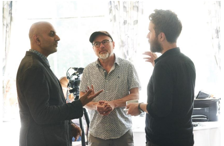
Airship dreams: Creative Forum

We commission artists to create new work with, in, and for, communities. This is done through any artform. We focus on social engagement through the arts by working closely with communities which can involve co-commissioning, participation and co-creation. We often work with those who don't normally engage with the arts.