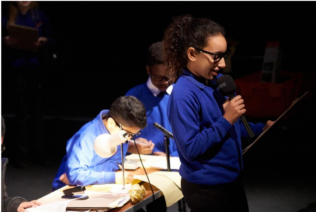
News,News,News

We have recently launched a Producer Hub for Bedford with 1 Degree East that mentors and supports local producers and self-producing artists to develop their skills. We are also co-founders of the free practitioner network, Creative Bedfordshire, regularly delivering networking and skills sharing events for our creative community.